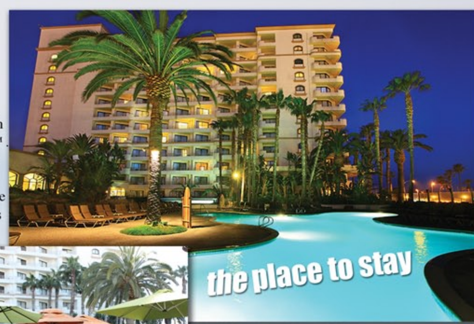
the place to stay