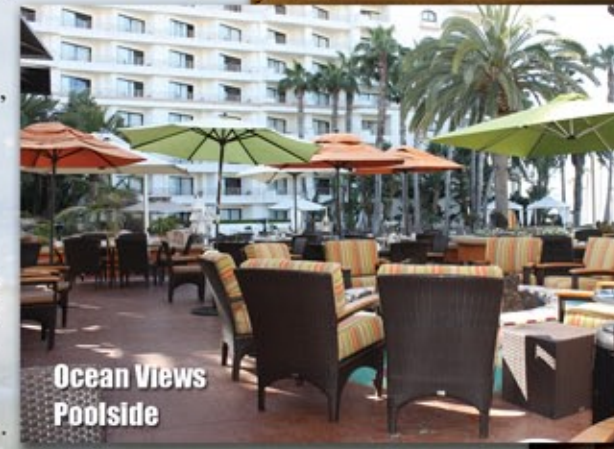
Ocean Views Poolside