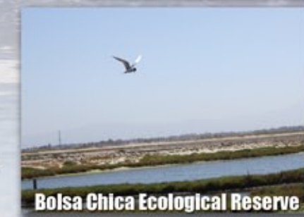
Bolsa Chica Ecological Reserve