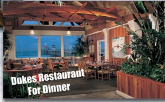
Duke's Restaurant For Dinner