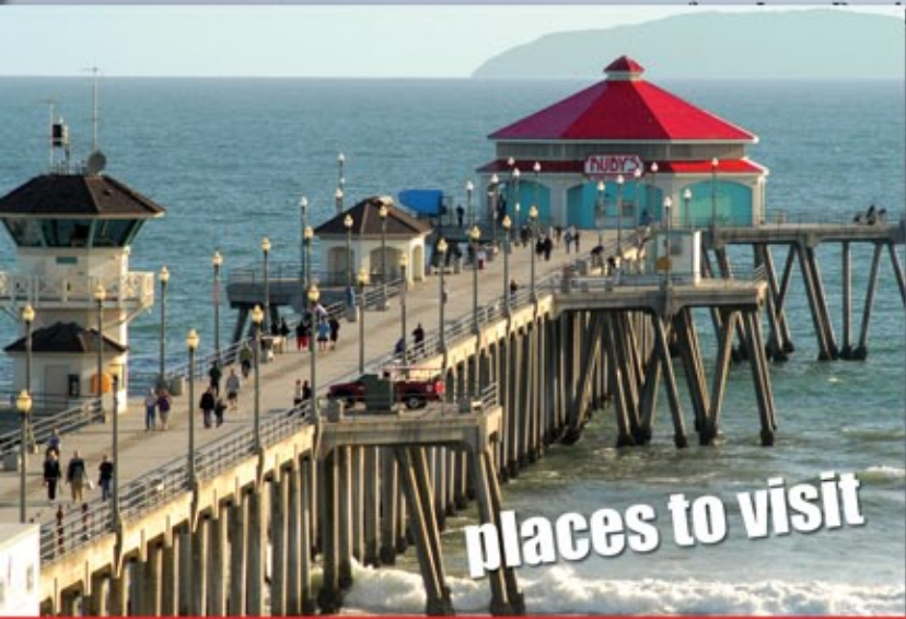
places to visit

Bordered on one side by Pacific Coast Highway and oil fields and houses on the other, Bolsa Chica Ecological Reserve wetlands is a 300 acre coastal sanctuary for wildlife and migratory birds. There's a wooden bridge crossing over a tidal inlet and a 1.5 mile loop trail providing spectacular wildlife viewing. www.wccoc.org