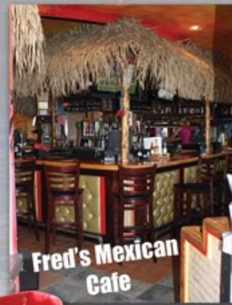
Fred's Mexican Cafe